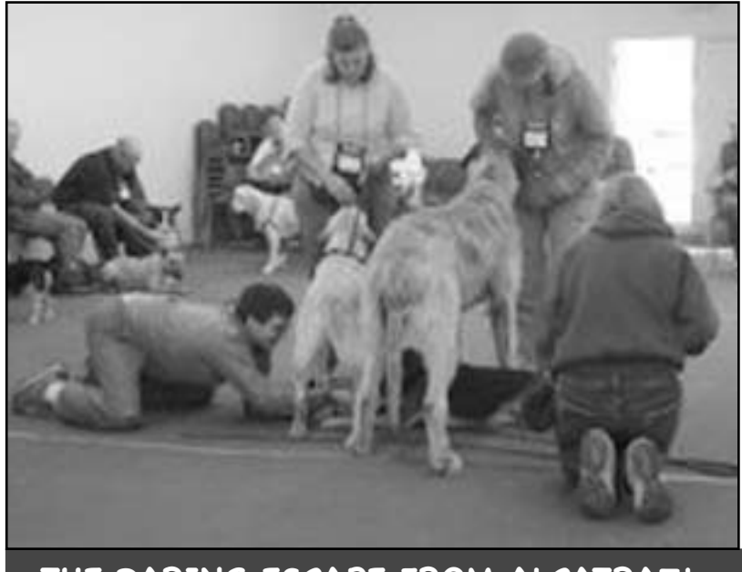
THE DARING ESCAPE FROM ALCATRAZ!

To escape from Alcatraz, the team had to do various things that wouldn't be part of any standard obedience training. Teams were scored not only on being able to accomplish the tricks, but on creativity and the "WOW factor". Wolfhounds start out with an advantage in that category because no one expects them to do much of anything. I wasn't too opti-