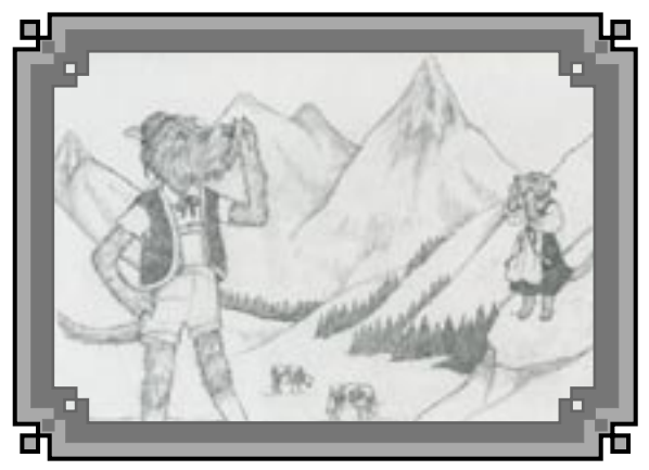
No Yodeling Required! It's not that kind of echo!

Echoes will be available all day Thursday and Friday, April 27 and 28, at the Purina Farms show site. However, appointment times are limited and reservations are required, so stop by the IWF Health Testing Tent and sign up your wolfhound.