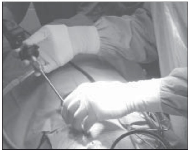
The camera is inserted through the trocar to allow the surgeons to see the organs.