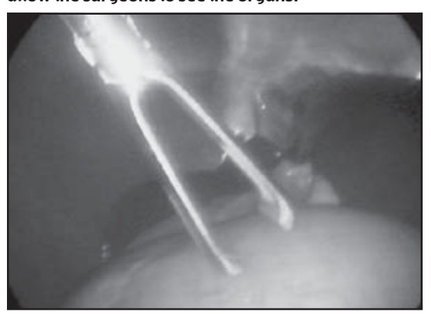
The forceps are about to grasp the stomach, as seen through the lens of the camera. The liver and diaphragm can be seen in the background.