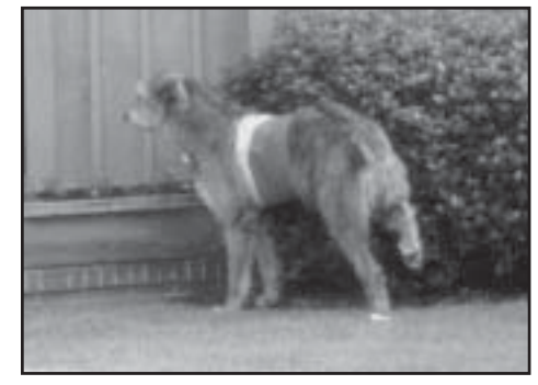
Solomon Dentino happily participates in all the IW studies, including urinalysis at the specialty and Dr. Bright's holter monitor study. Solly says, "It's for the good of the breed!"

There is much new information about early detection and treatment of canine kidney disease. Remaining kidney function can often be prolonged for months/years with medication and simple dietary changes. The results are best when these are started early—long before symptoms occur. Treating even mild elevations of blood pressure in these patients may be as helpful as in humans. The Irish Wolfhound is one of the few breeds with well documented normal blood pressure range, so these decisions should be clearer. Someday a urinalysis may be recommended for all IWs, as well as an annual EKG.